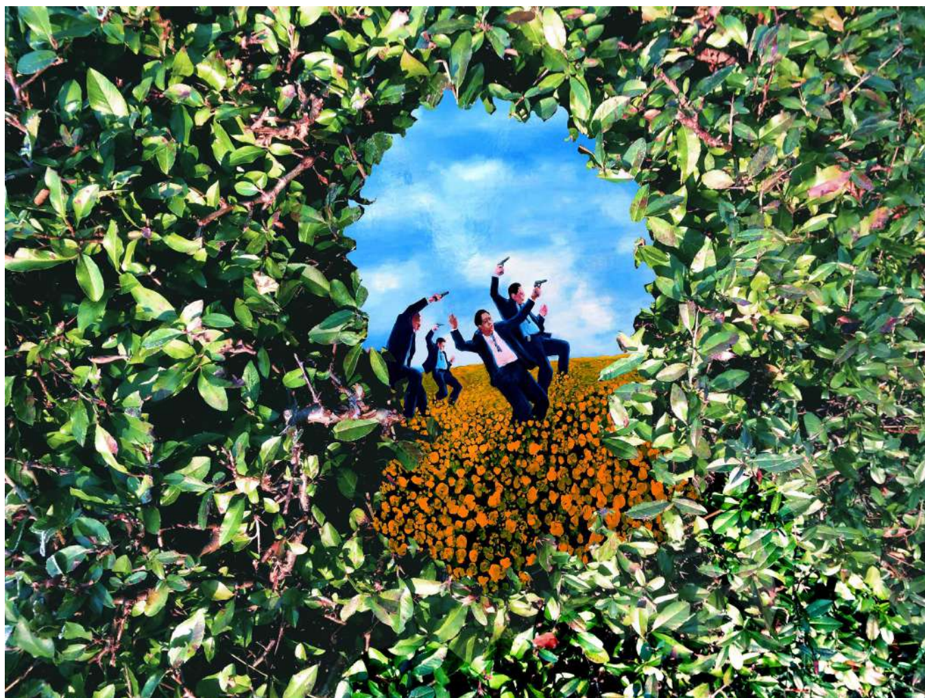
Oh flowers Vinyl on foamboard 39.9cm x 62.9cm 2019