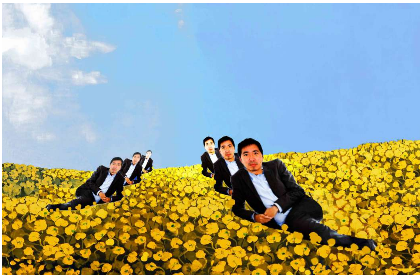
The funny song Vinyl on foamboard 40cm x 61.5cm 2019