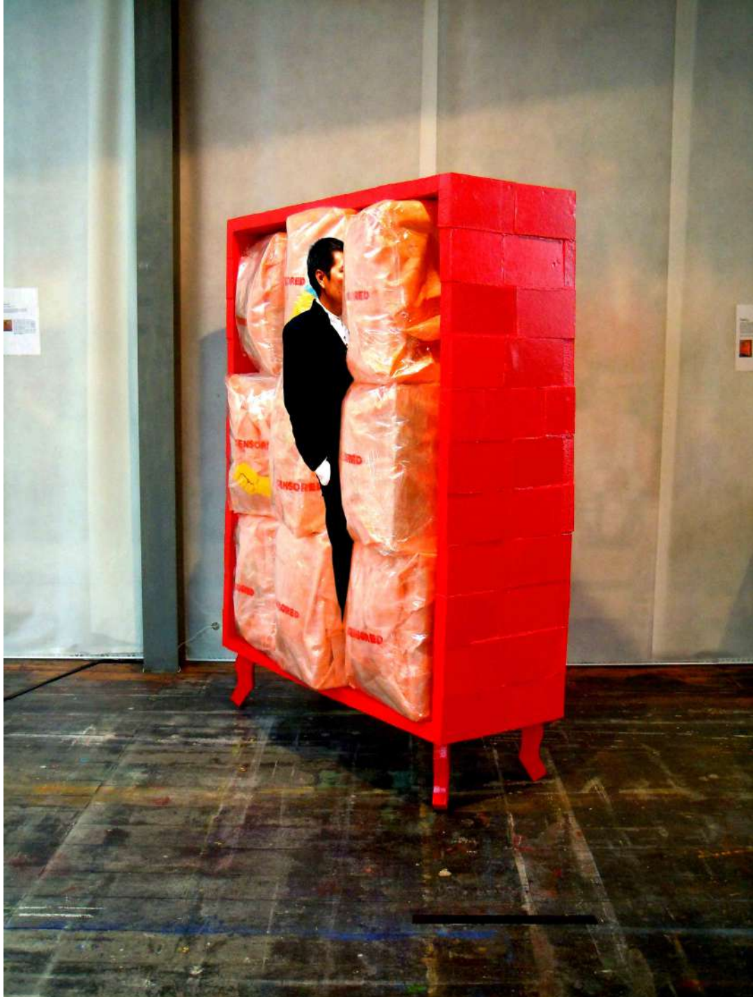
The red wardrobe Vinyl on foamboard 39.8cm x 29.6cm 2019